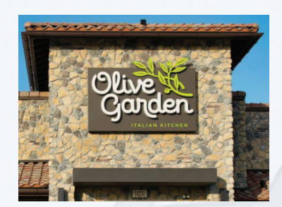
Outing to Olive Garden Restaurant Tuesday, 6/18 at 11:30 am With unlimited menu items, and tasty Italian

Time to put your green thumbs to work and get planting! Let's dig in the dirt and make some happy plants!